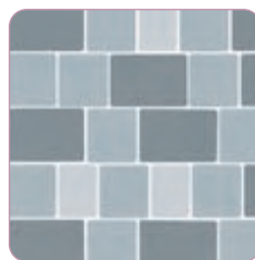
Traditional Formal Bond pattern (using Sett 1, 2 & 3)