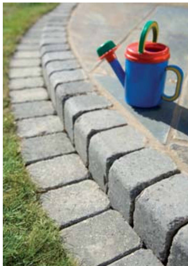
Chelsea Kerbs in Charcoal.