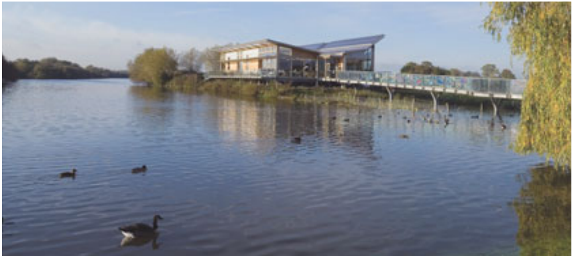
THE AWARD WINNING ATTENBOROUGH NATURE RESERVE, PREVIOUSLY A CEMEX QUARRY.

For more information visit our website: www.cemex.co.uk/sustainability